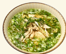
P9. PHỞ GÀ

Rice noodle soup with French corn fed chicken DFL24