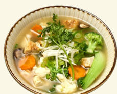
P10. PHỞ VEGAN V

Rice noodle soup in a vegetable broth with fresh vegetables, shiitake mushrooms and tofu FIK