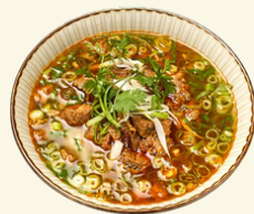
P8. PHỞ SỐT VANG

Rice noodle soup with tender beef stew braised in red wine DFL24