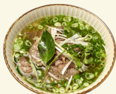
P7. PHỞ BÒ CHÍN

Rice noodle soup with well done beef brisket DFL24