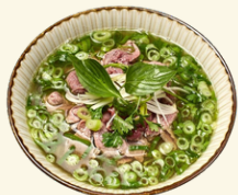
P6. PHỞ BÒ TÁI

Rice noodle soup with medium rare beef slices DFL24